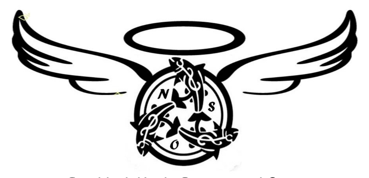
Good luck Noah, Summer and Owen, our BLISS FISH! You make us proud everyday! Swim Hard, Swim Fast and Always Believe! -Love, Mom and Dad!